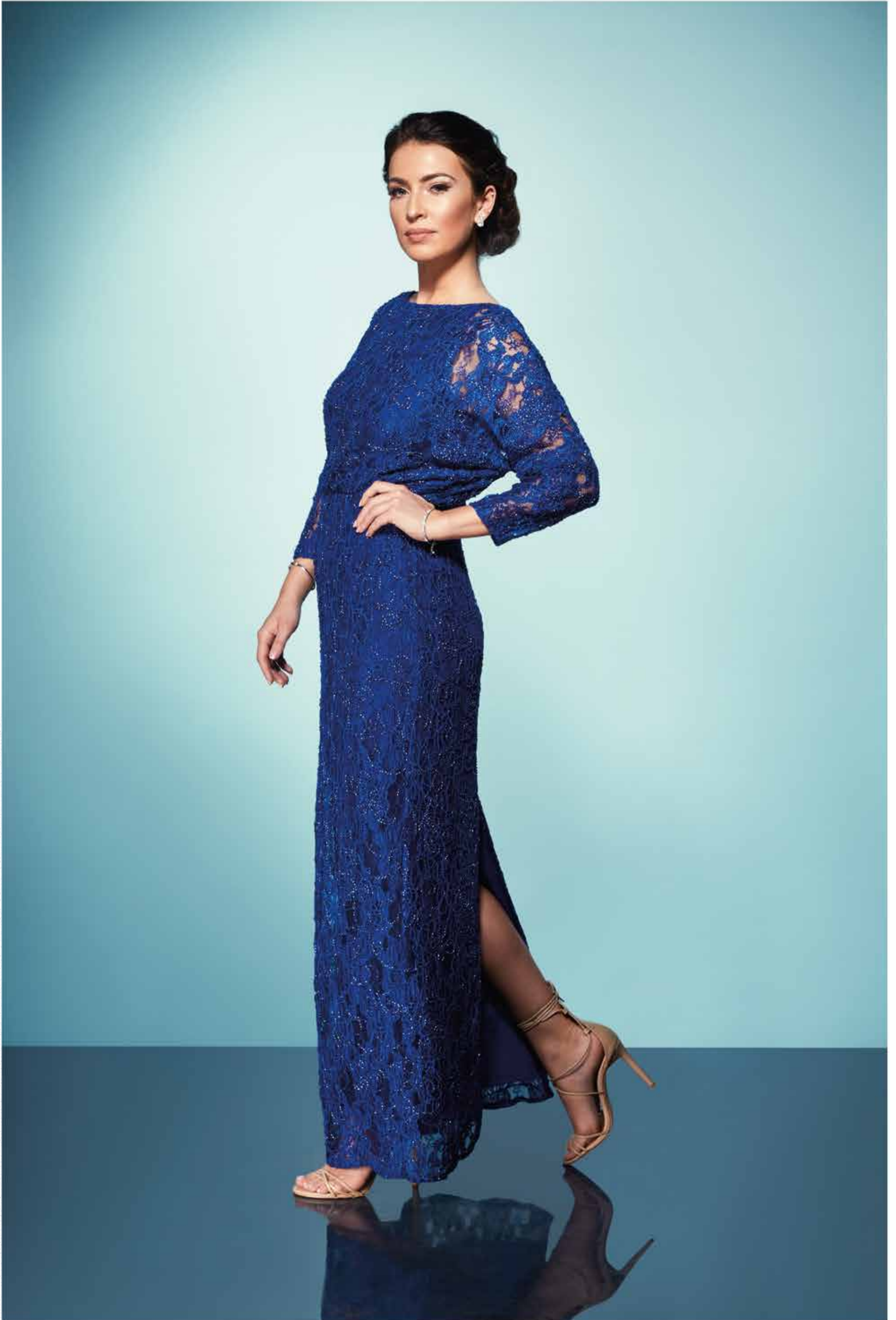
ARIELLA ARIAH COBALT BLUE BEADED LACE BATWING BLOUSON COLUMN MAXI DRESS